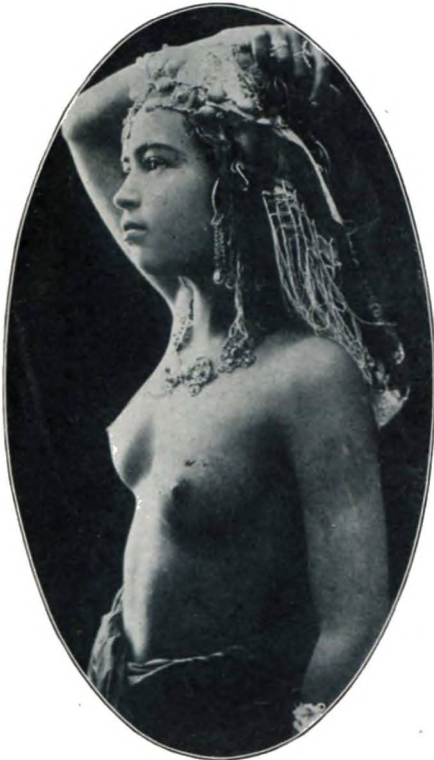
"Debia" in "An Algerian Wooing" Next month